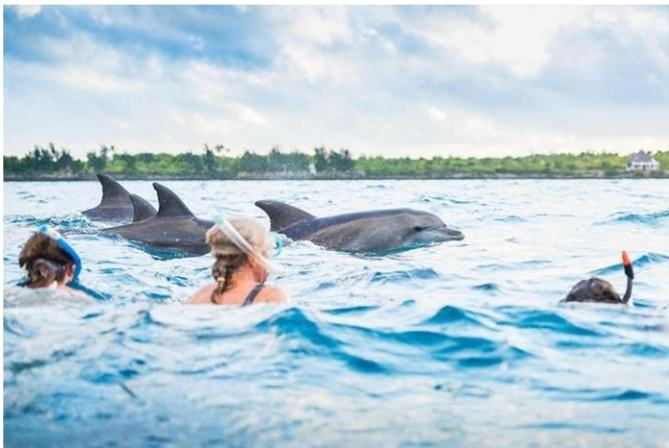
Swimming with Dolphin