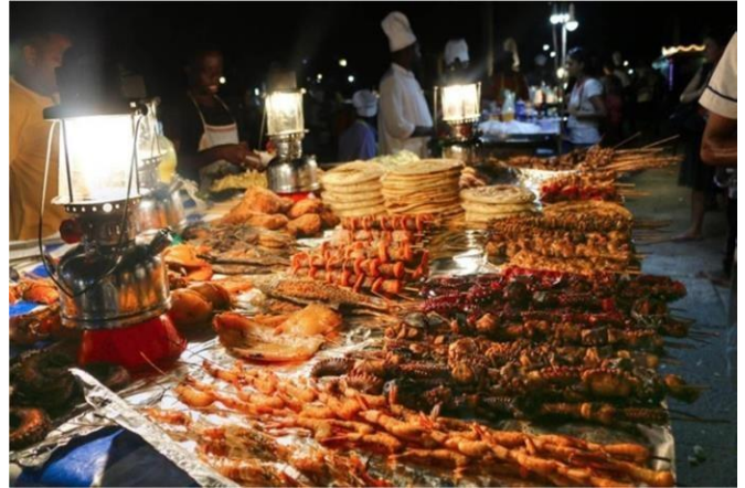
Zanzibar food taste and delicacy at Forodhani